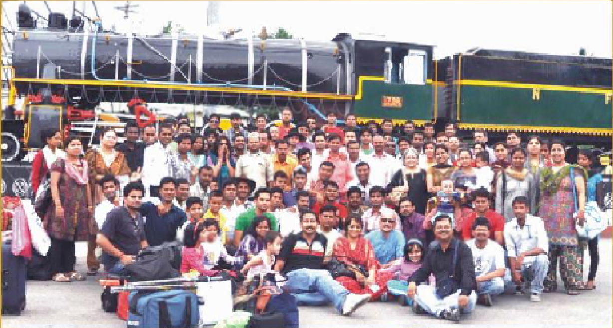
Drishtee team get together at Gangtok, May 2011

In rural India a large human resource is available and by 2015 more than 5 crores of human resource will be needed in the area of ICT. If the available resource is given computer training then only can we fulfill the needs of these jobs.